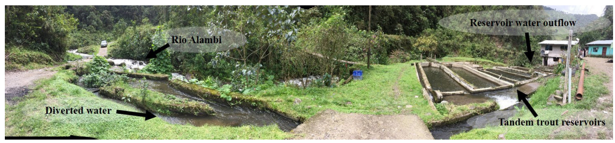
Fig. 1. Trout farming in the Mindo region of Ecuador utilizes a flow-through aquaculture technique. Stream water is diverted into tandem raceways/holding reservoirs and then flows through these reservoirs back into the natural stream system. This figure displays a panoramic view of Finca de Jaime's (FJ) set-up.

al. 2012; Pearson and Goater 2009). Many amphibian species have been shown to demonstrate a lack of predator avoidance in response to this introduced fish (Gall and Mathis 2010; Garcia et al. 2012), though this information is limited to temperate amphibian larvae and it is unknown whether predator avoidance is demonstrated in tropical amphibian larvae. However, in a recent laboratory study, Martín-Torrijos et al. (2016) found that the presence of O. mykiss altered larval morphology in Nymphargus grandisonae, a glassfrog species included in this survey. The extent to which O. mykiss presence may affect the glassfrog larvae in situ has yet to be determined. Additionally, O. mykiss can introduce pathogens to naïve amphibian communities, including aquatic fungal pathogens such as Saprolegnia diclina (Martín-Torrijos et al. 2016) and iridoviruses like ranavirus, a pathogen that has caused amphibian population declines and extirpations across the globe (Miller et al. 2011; Smith et al. 2017). Together, these studies suggest O. mykiss introductions may negatively affect glassfrog population persistence by decreasing larval survival through both direct (predation) and indirect means (aquatic pathogen introduction).