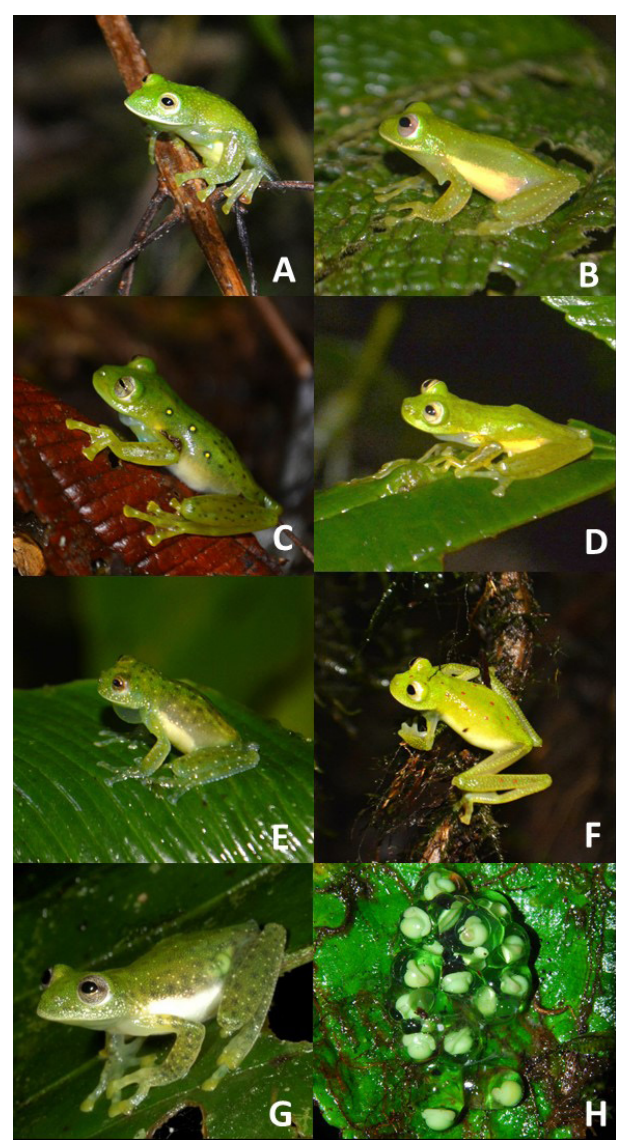
Fig. 2. Glassfrog species found during surveys. (A) Centrolene heloderma, (B) Centrolene ballux, (C) Esparana prosoblepon, (D) Nymphargus lasgralarias, (E) Centrolene peristictum, (F) Nymphargus grandisonae, (G) Centrolene lynchi, (H) Egg mass from C. ballux. Nymphargus griffithsi was not encountered during the 2017 survey but has been documented at Kathy's creek in 2012 and 2013 (by Jane A. Lyons).

Overnight call surveys were conducted between 2000 h and 0200 h at each survey site (Mean: 3.38 \pm 1.9 SD visits per site) on multiple dates during the rainy season, when glassfrogs are reproductively active (JMG, pers. comm.). Surveying included 2–8 visits per site with the exception of a single site (C) which was only visited on a single occasion due to safety concerns associated with heavy rains and steep, eroding terrain. The presence of each of the documented species was recorded at first visit at each site, therefore sampling effort did not bias the detection. It should be noted that the species recorded at site C on 30 March 2017 were the same as had been previously observed at the site in March–May in 2012 and 2013 (JAL, pers. comm.). Species presence was assessed